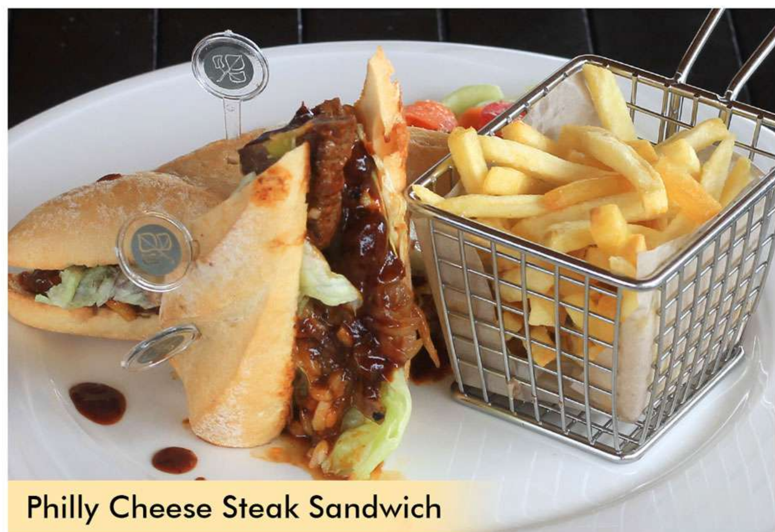
Philly Cheese Steak Sandwich

Marinated beef slice in french bread with caramelized onions and mozzarella, served with carrot salad and fries.