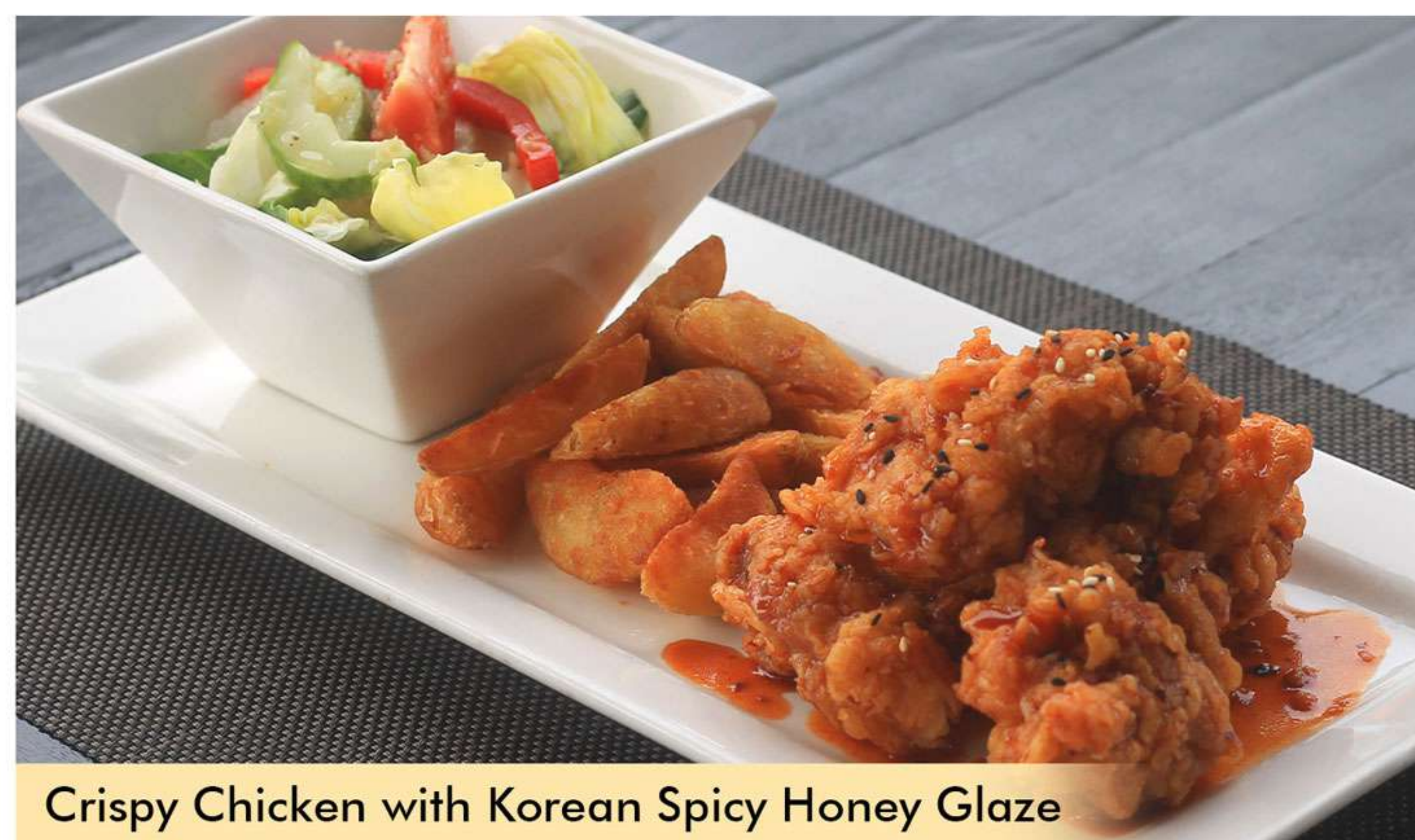
Crispy Chicken with Korean Spicy Honey Glaze

Crispy and battered boneless chicken leg toasted with Korean spicy honey sauce, served with potato wedges and salad.